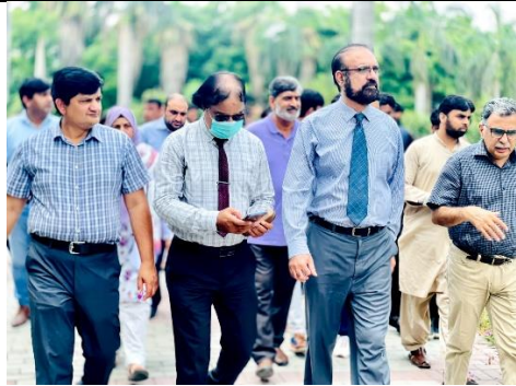
Agriculture & Forestry Pictures